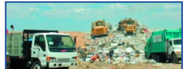
The landfill receives roughly 800 tons of trash every day!

The Larimer County Landfill is proud of its reputation for environmentally sound waste disposal.